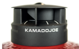
Kontrol Tower Top Vent