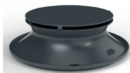
Patented Hyperbolic Insert