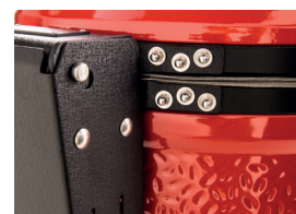
Air Lift Hinge