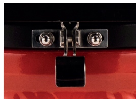
Stainless Steel Latch