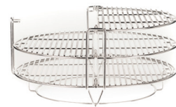
Divide & Conquer® System