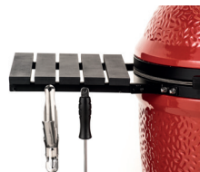
Aluminum Side Shelves