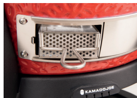
Patented Ash Collector